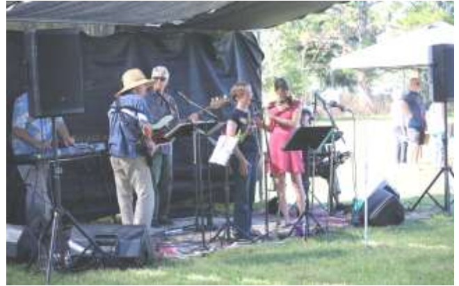
Weeds of Eden