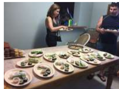
Yummy Vegan Food