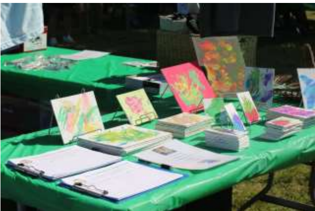
Beautiful Monkey Art