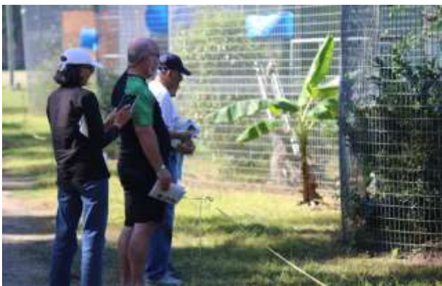
Guests visit capuchins in Oz