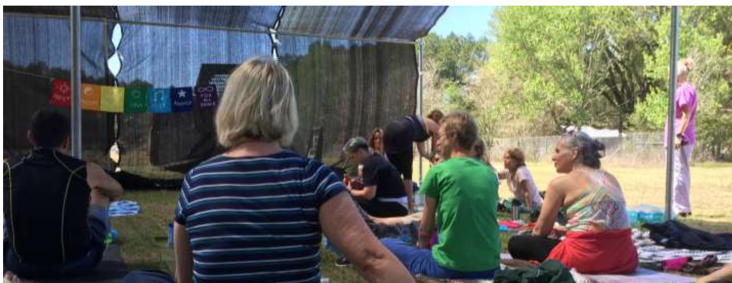
Time for Yoga