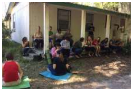
Enjoying Lunch and Fellowship