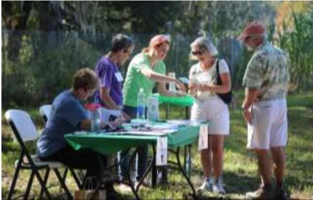
Checking in for Monkey Day!

Once a year we celebrate Monkey Day! Our supporters are invited to attend the event and have the opportunity to see how their donations are advancing our mission. November 4th was our 5th Annual Monkey Day. There was live music by Weeds of Eden , educational speakers, vegan food and refreshments, raffles and silent auctions. A good time was had by all, especially the monkeys!